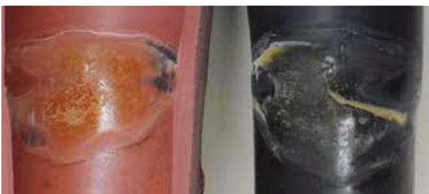
One of the three HV cables at the Grangemouth site where routine testing revealed critical PD activity.

During the ten-month period, monitoring was continuous and the issue showed no critical degradation, so both parties were comfortable with staying online. Had severe deterioration or an increased frequency of PD been discovered, our advice might well have been to shut down.