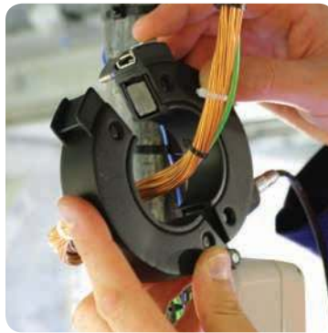
2. Clip On

The CableData Collector™ detects and quantifies PD activity in live distribution cables by measuring radio frequency currents, which are produced when discharges occur.