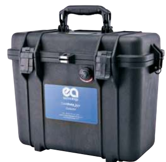
Rugged carry case