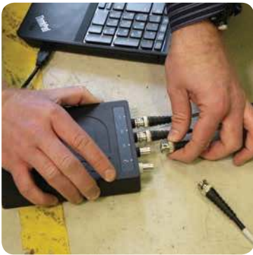
1. Plug In

The CableData Collector™ detects and quantifies PD activity in live distribution cables by measuring radio frequency currents, which are produced when discharges occur.