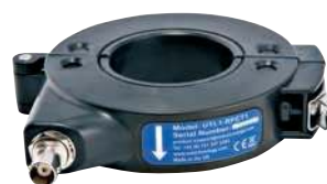
Radio Frequency Current Transformer (RFCT)