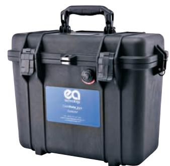
Rugged carry case