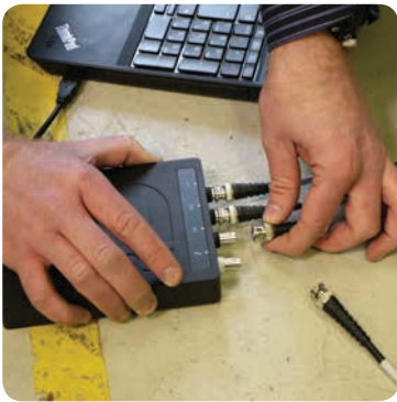
1. Plug In

The CableData Collector™ detects and quantifies PD activity in live distribution cables by measuring radio frequency currents, which are produced when discharges occur.