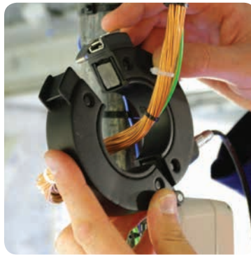
2. Clip On

The CableData Collector™ detects and quantifies PD activity in live distribution cables by measuring radio frequency currents, which are produced when discharges occur.