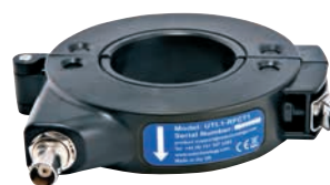
Radio Frequency Current Transformer (RFCT)