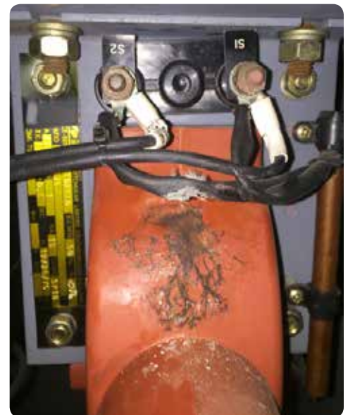
Figure 1: Electrical treeing on CT

"We were fortunate to find EA Technology who introduced us to PD technology, they surveyed all site HV switchgear within a day and submitted a detailed report, the survey was able to find failing CT which we have been able to change at our convenience rather than it fail in production."