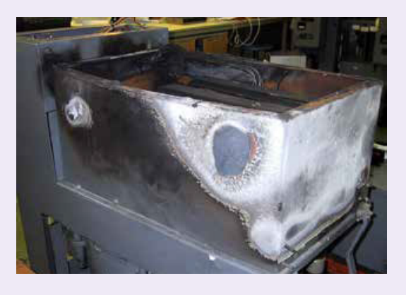
Explosion in 3.3kV circuit breaker.