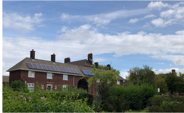
Photovoltaics on a residential property

The number of PVs connected to LV networks is not always known by network operators, however identifying and characterising reverse power flow is a clear indication of significant PV penetration. This is useful for a number of reasons. For instance, when design engineers are looking to install new connections on the network, there may appear